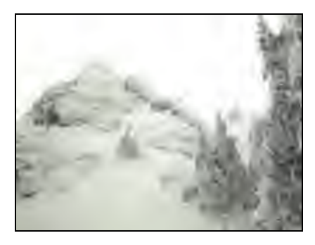
Haystack Rock on Mount Si