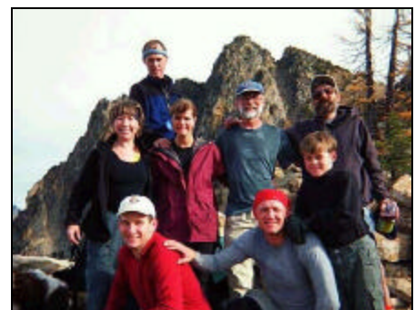
October 2000 ascent of Hinkhouse Peak