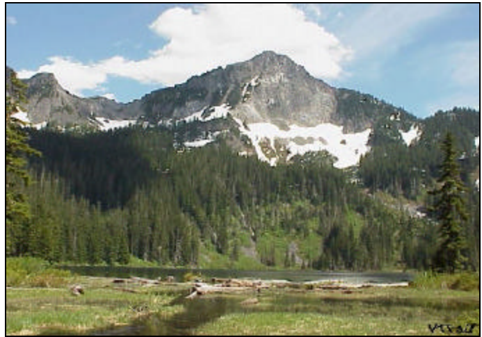
Kaleetan Peak