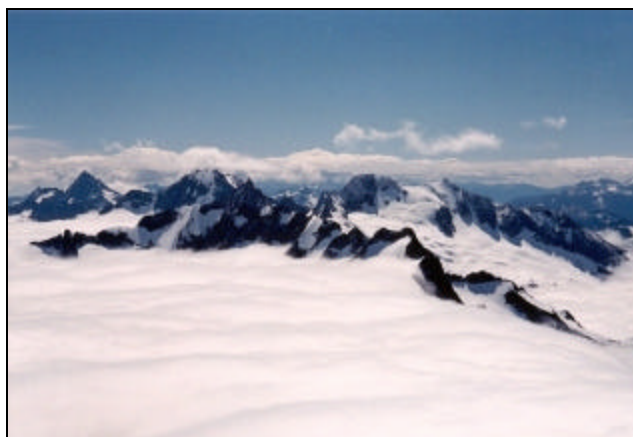
Forbidden Peak (8815 ft) center foreground with North (left) and West (right) Ridge Routes

Particulars: West Ridge Of Forbidden Permit: Required Difficulty: Grade III, 5.6 Equipment: Ice Axe, crampons, pickets, medium rack, slings, helmet Time: 2 days. Or one very long day First Ascent: (who else) Fred Becky Classic rating: *****